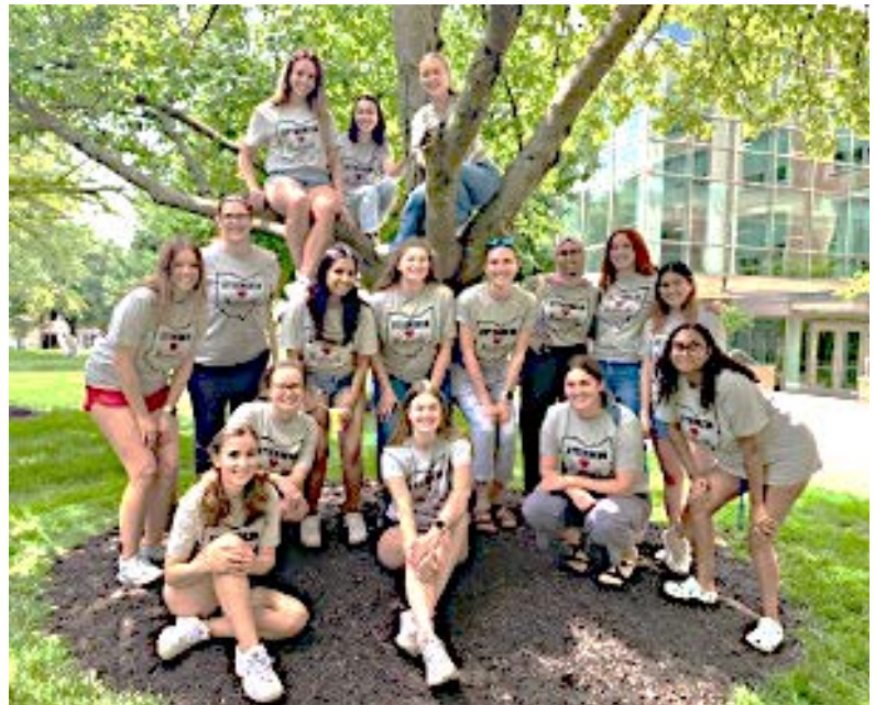
CardinalCorps Leaders mobilizing volunteers for the Fall Community Service Plunge

Fall Community Service Plunge: Each fall, 300 First Year students engage in community service for the City of Westerville as part of their introduction to the civic workings of their new local community. The Mayor of Westerville welcomes the students to the community, noting their new civic role as members of a thriving local democracy. The students gather on the steps of the city’s “civic green” to learn about both the beauty and the growing needs of their new home. After the speeches, students disperse into civic teams to serve with local non-profits, learning about the specific needs of youth, adults with disabilities, the environment, and other key issues, followed by two hours of volunteer service to address those needs.